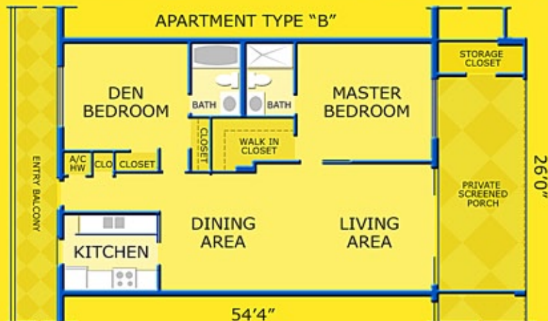
APARTMENT TYPE "B"